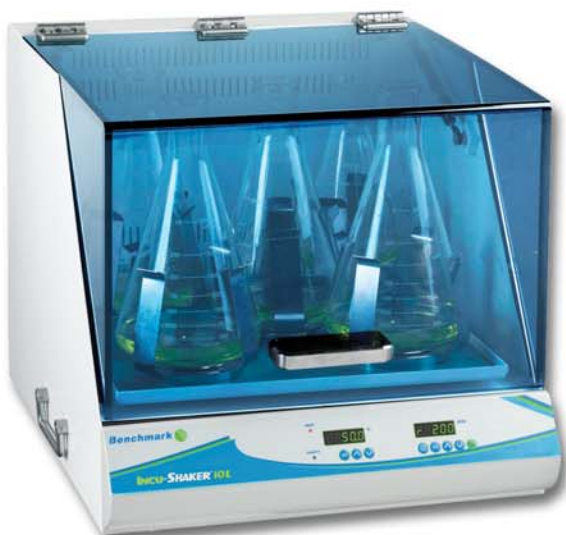
Incu-Shaker 10L (H1010)

The new Incu-Shaker™ series of shaking incubators provide digitally regulated temperature with precisely controlled, horizontally circular (orbital) mixing, optimized for the culture of a wide variety of cell types.