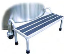
Optional Step for 800 Series

There is a critical temperature for most biological samples that are cryopreserved. This critical temperature is known as the Glass Transition Temperature (T g ) of water, which is widely accepted as being in the order of -130° to -135°C. The long-term viability of frozen samples can be seriously compromised if stored above this temperature range. Further, if they experience several transitions through this range in either thermal direction, additional deterioration may occur. It is important that the LN 2 freezer maintain a lower temperature, even during filling and sample retrieval cycles. This is much more likely to be achieved if the freezer maintains a temperature of -190°C than if the system is at or near the critical temperature at