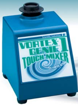
HIGH SPEED MIXER